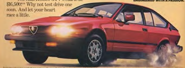
For further information on Alfa Romeo or the new European Delivery Program, and your local dealer, call and the dealer nearest you, call toll free 1-800-441-4386. *Limited warranty applies only to U.S. spec. automobiles purchased from authorized U.S. Alfa Romeo dealers. **MSRP. MSRP, actual price at U.S. dealer. Actual price may vary. Dealer, state, taxes, license, title, and other options. Excludes freight and tax. See dealer.

The Alfa Romeo GTV-6 starts at $16,500*. Why not test drive one soon. And let your heart race a little.